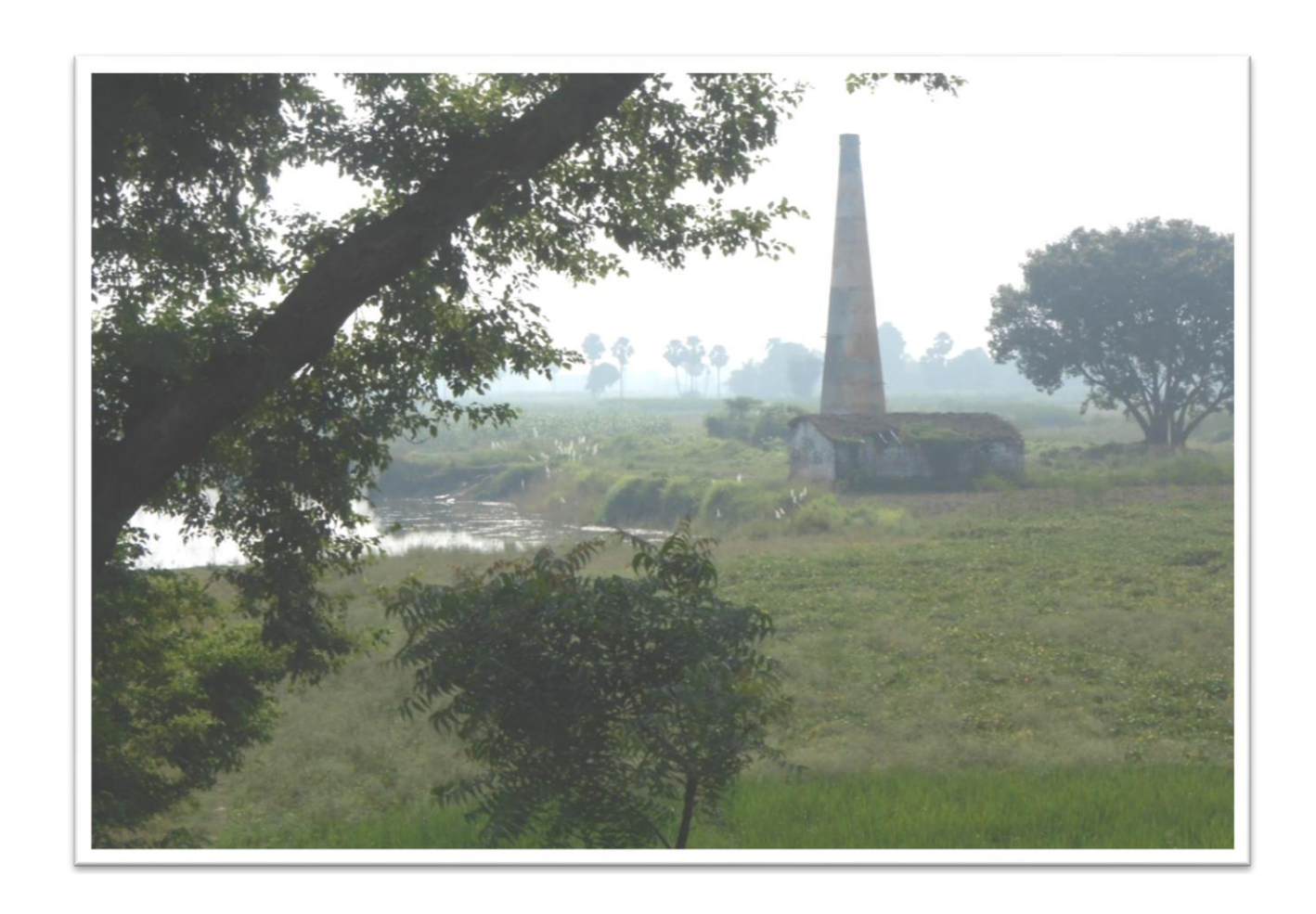
Submitted To Bihar Urban Infrastructure Development Corporation Ltd. 303, Maurya Tower, BuddhMarg Patna – 800001.